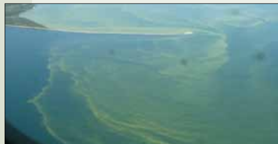
Aerial photo of Lake Erie blue-green algal bloom near Kelley's Island, Sept. 4, 2009.

Blue-green algae are the most common, but not the only group of algae to form HABs. Blue-green algae are actually bacteria (cyanobacteria) which are able to photosynthesize, hence the green color. Cyanobacteria live in terrestrial, fresh, brackish, or marine water. They usually are too small to be seen individually, but sometimes can form visible colonies. Some cyanobacterial blooms can look like foam, scum, or mats on the surface of fresh water lakes and ponds. The blooms can be blue, bright green, brown, or red and may look like paint floating on the water. Some blooms may not affect the appearance of the water. As algae in a cyanobacterial bloom die, the water may smell bad. If you detect an earthy or musty smell, taste or see surface scum's of green, yellow or blue-green, the water may contain blue-green algae. Only examination of a water sample under the microscope will confirm the presence of blue-green algae.